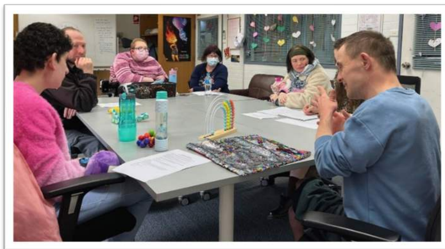
1 st Meeting of Disability Advisory Committee

We promote inclusion, dignity and advocacy